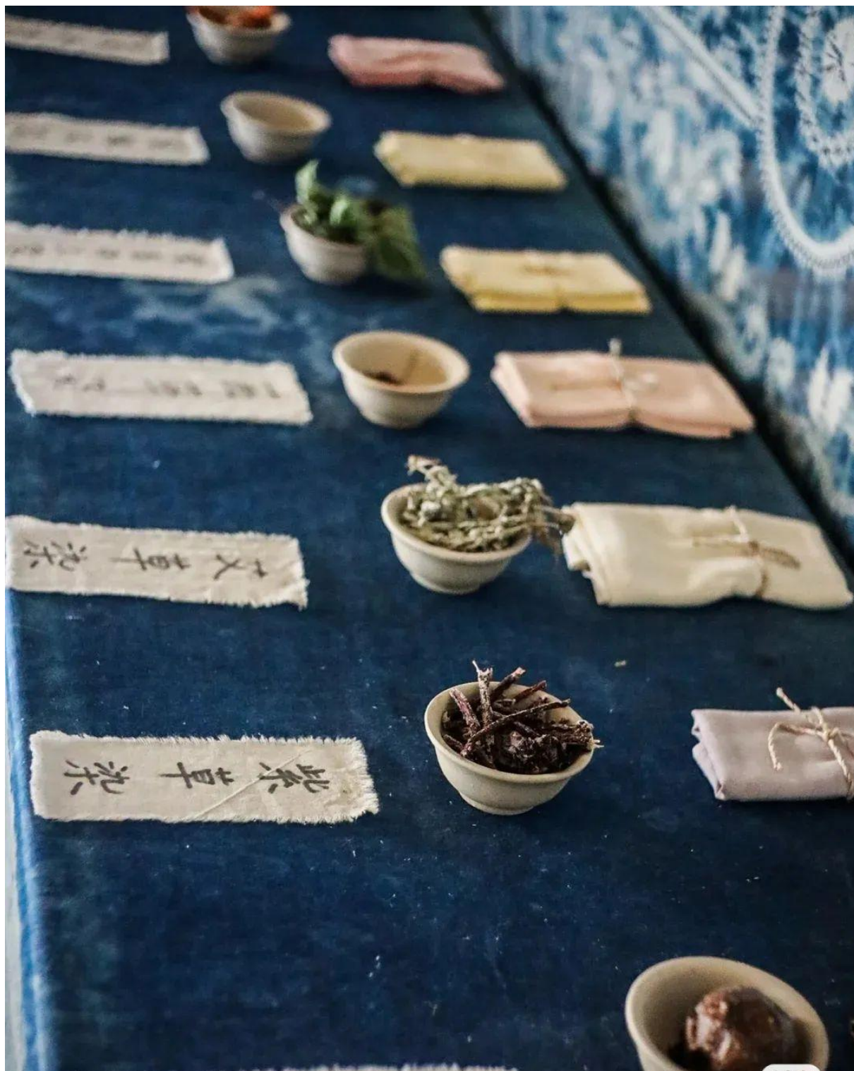
蓝靛之美 Beauty of Indigo