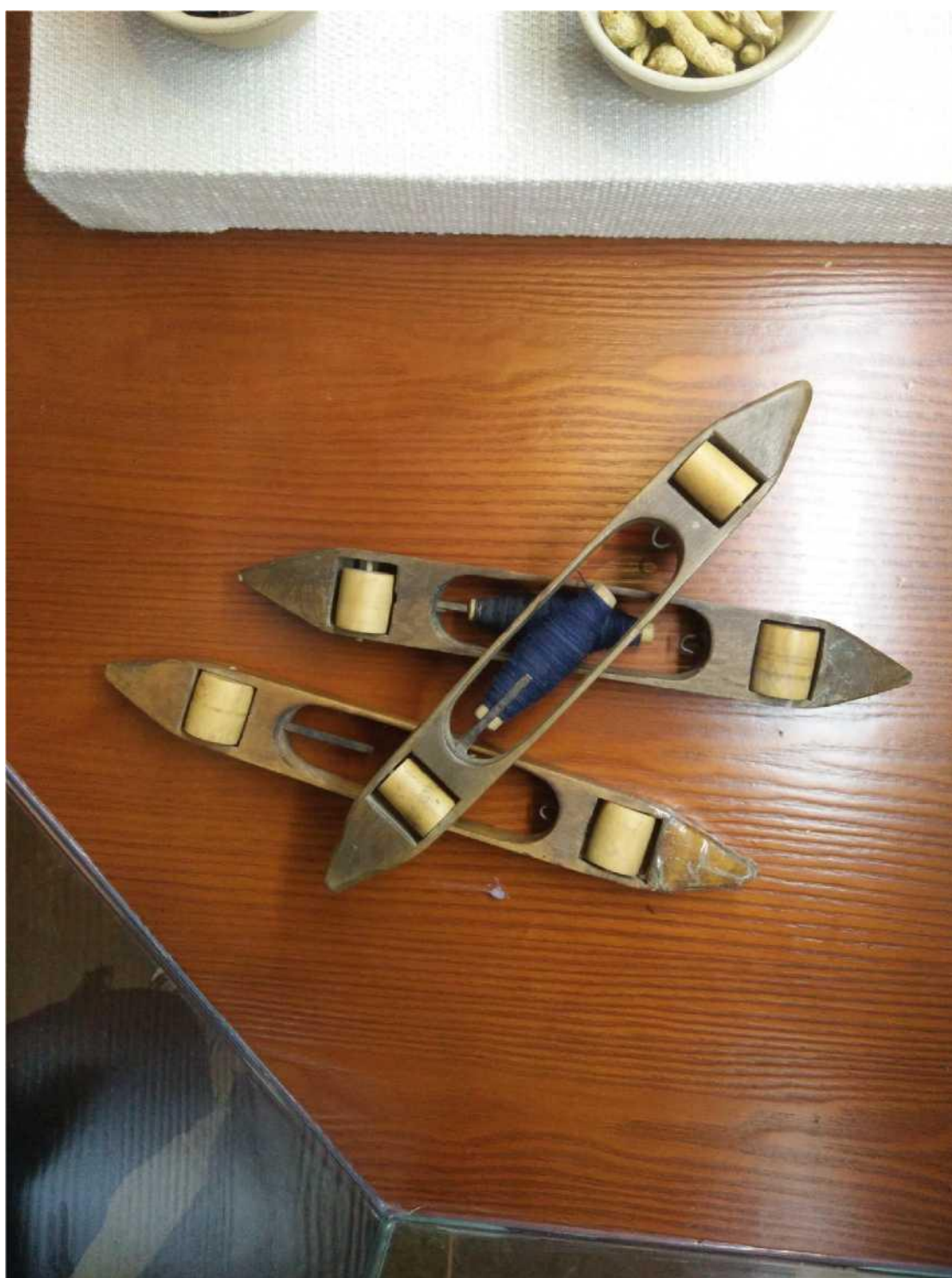
以上是扎染所需要的原材料和工具 These are the raw materials and tools for tie-dyeing.