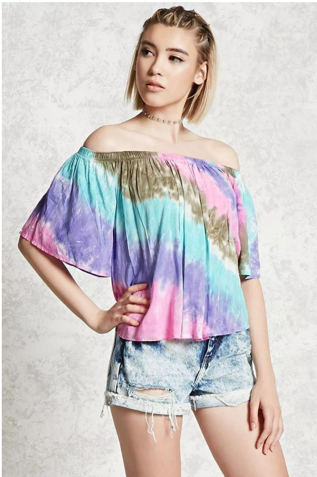
▲一字领上衣: Forever21 169