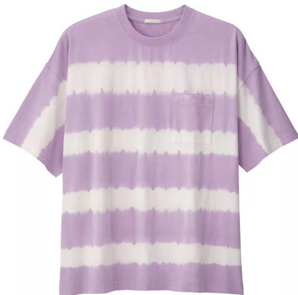
▲T 恤: GU 129