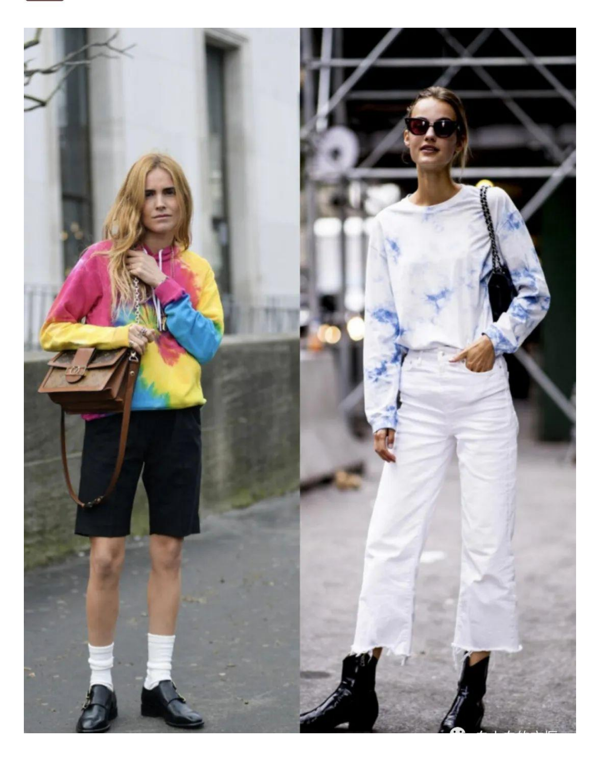
扎染牛仔 Tie-dye denim