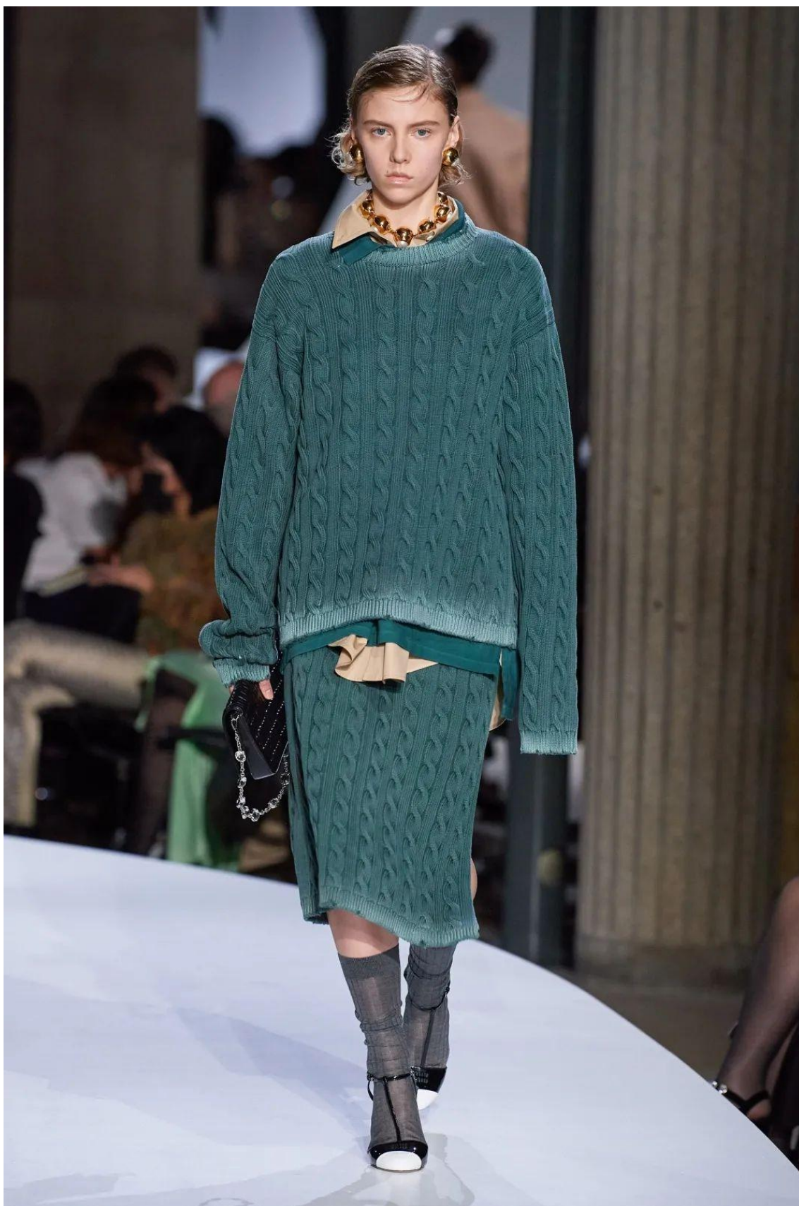
△ Miu Miu