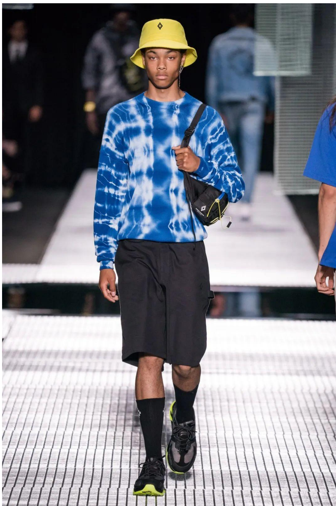
△ Marcelo Burlon