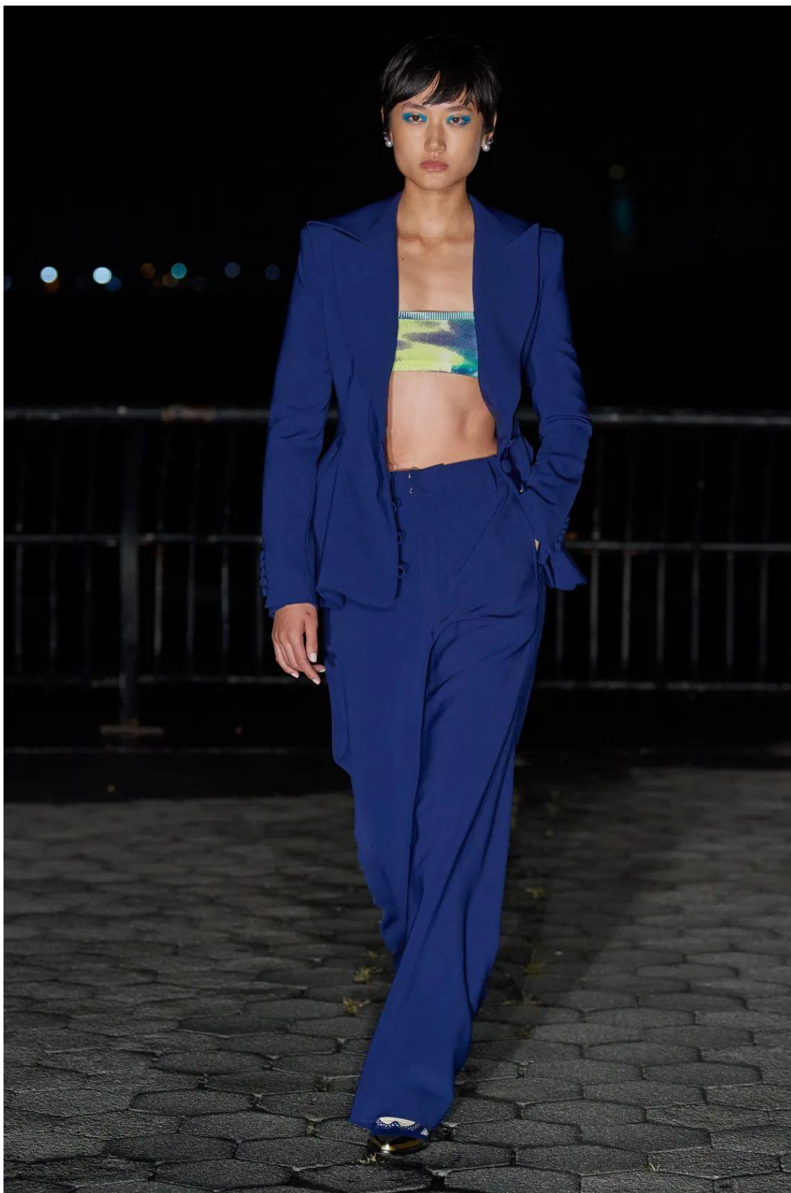
△ Prabal Gurung