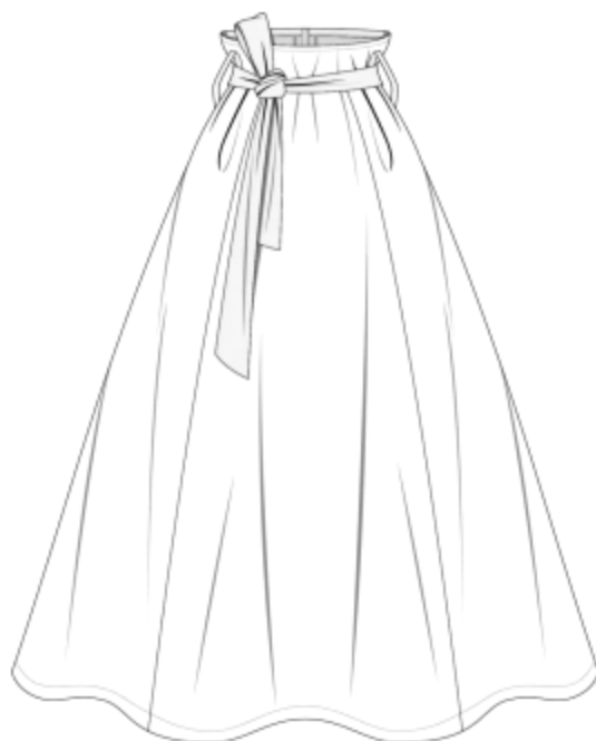
蝴蝶结长裙 Long skirt with bow