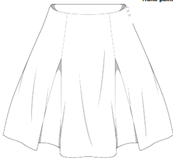
对褶短裙 Pleated short skirt