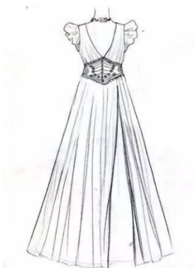
纱质礼服裙 Gauze dress skirt